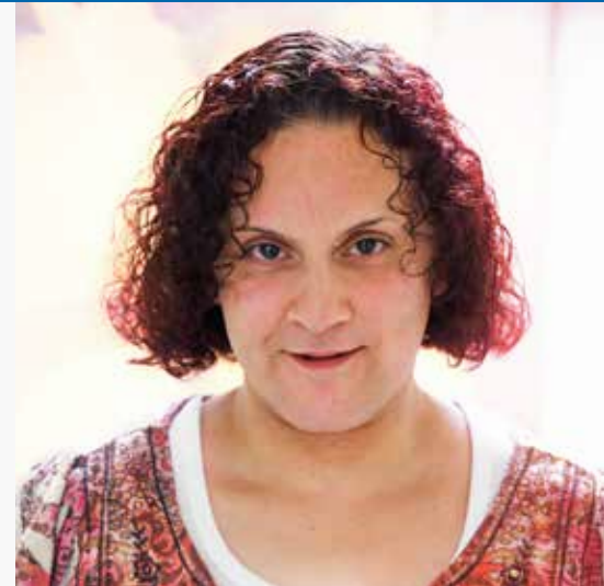
*names changed for privacy